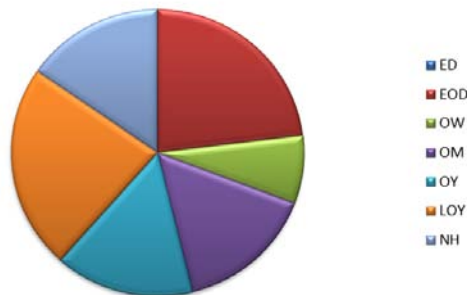
How often do you buy fairtrade?

believed fair-trade is very important, showing not only the elderly think about the issues.